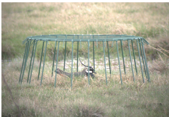
Fig. 1 – Male lapwing incubating in the nest exclosure, made of a top ring ( \varnothing = 60 cm) and a bottom ring ( \varnothing = 70 cm) connected by 26 cm welded bars. The spacing between sidebars (6.5–8.5 cm) varied for each species. Four sidebars extend down by further 20 cm to anchor the exclosure. The roof is made of 4 × 4 cm steel bar netting extending 7 cm beyond the sides, pointing slightly downwards, to prevent foxes and badgers from tilting the cage or reaching the nest from the sides. Exclosure weight is 3.3 kg.

The most common design of exclosures used in previous studies is circular or triangular, made of woven mesh wire, with a diameter of 1–3 m and a height of 1 m, with or without a roof (e.g. Rimmer and Deblinger, 1990). Our exclosures were smaller (Fig. 1), similar in size to those of Estelle et al. (1996). In our study areas there are cattle, and some predators (e.g. badgers) that might tilt the exclosure, so we used a firm construction designed by one of us (ML) and constructed from plastic coated steel bars. Before using the construction in the field, we tested and modify it using captive red foxes, badgers and hooded crows.